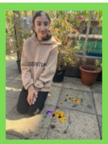
A lovely natural selfportrait created by one of our Young Farmers